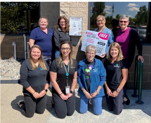
SPN members outside of Shiawassee Health & Wellness after the Narcan/Naloxone box was placed outside of the building; the first in Shiawassee County.

Shiawassee Prevention Network would like to acknowledge the participating agencies and pharmacies, Peer 360 Recovery Alliance for providing Narcan/Naloxone community trainings, and the Michigan Department of Health and Human Services for Narcan/Naloxone for assistance with ordering.